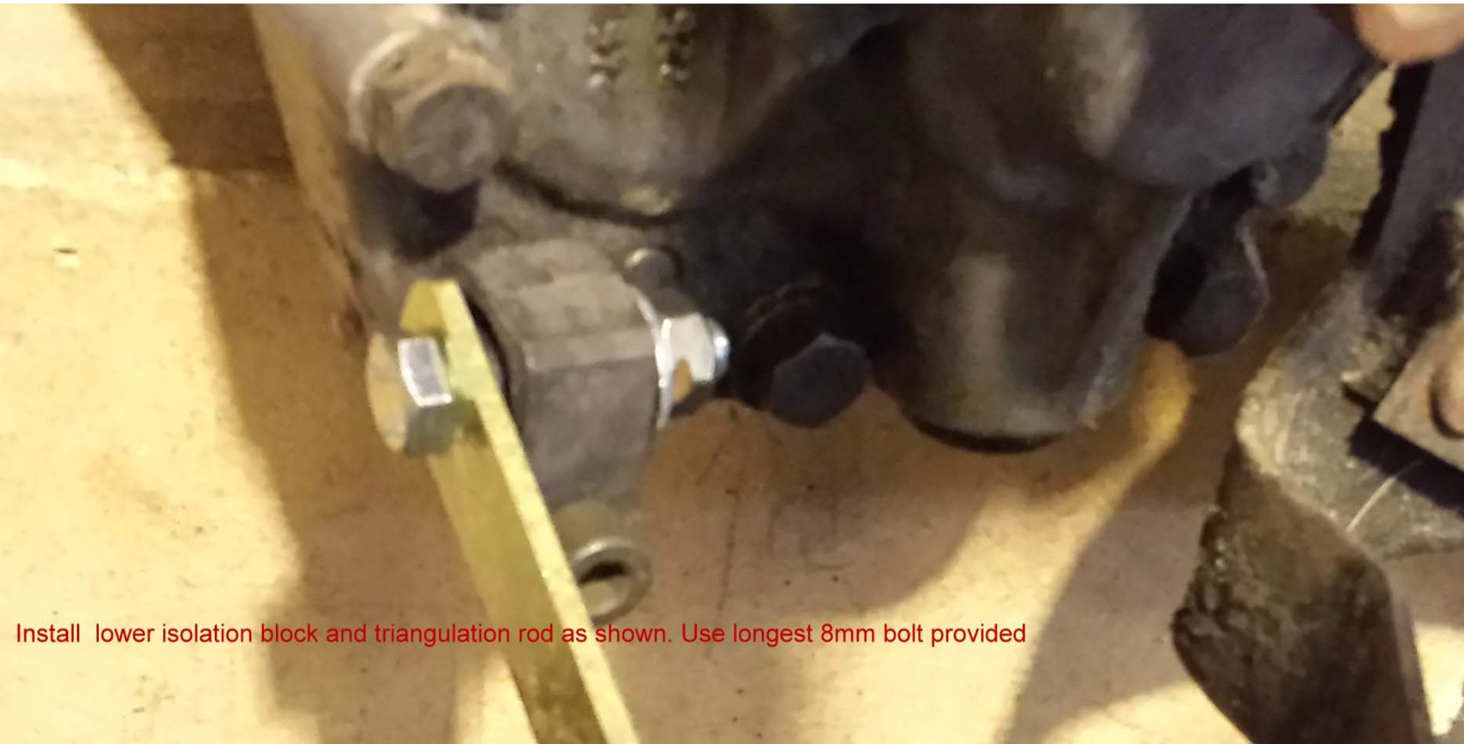
Install lower isolation block and triangulation rod as shown. Use longest 8mm bolt provided