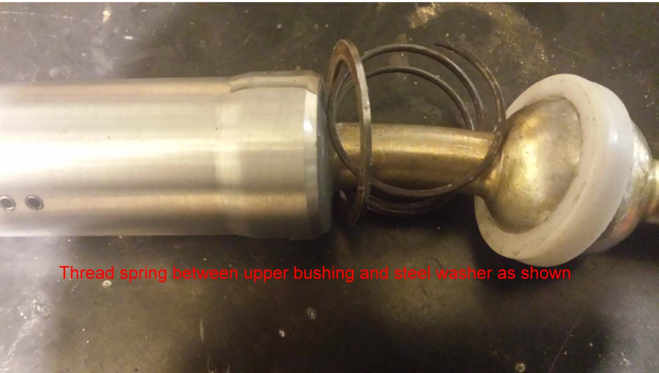
Thread spring between upper bushing and steel washer as shown